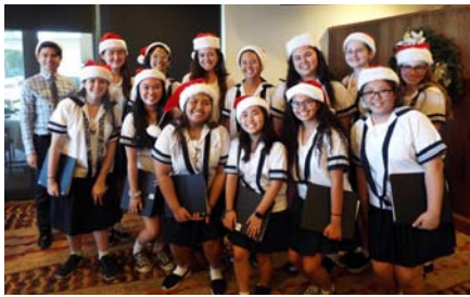
Mahalo to the ladies of Sacred Hearts Choir